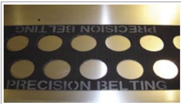
2-Out Tetrad, 209" Loop, 2.100 diameter, 7" Width