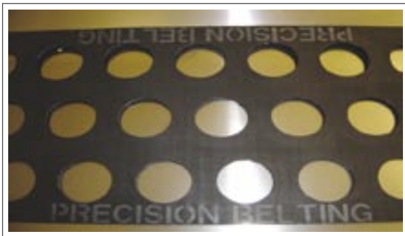
3-Out, 202, 2.100 diameter, 10.585 Width, 210" Loop

PTS provides conversion press belting for Stolle Machinery equipment.