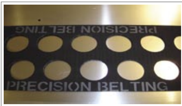
2-Out Tetrad, 209" Loop, 2.100 diameter, 7" Width