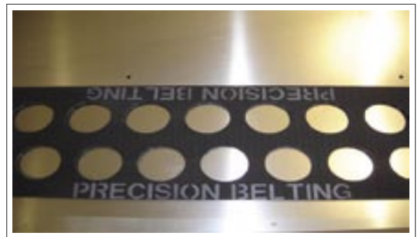
2-Out Tetrad, 209" Loop, 2.100 diameter, 7" Width